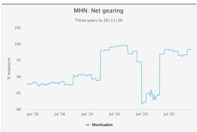
Fig.3: Net Gearing

In having fewer private investment commitments, the managers have more latitude to run the trust in a more fully invested position which now sees cash at only 1.7% of NAV. MHN has shareholder permission to employ gearing, but does not currently have a gearing facility in place. The trust has some outstanding commitments (which may not all be drawn) mainly to the TCI Real Estate Partners Fund. MHN's public equity portfolio remains highly liquid. So if these commitments are called, we do not envisage a problem for the managers in funding them.