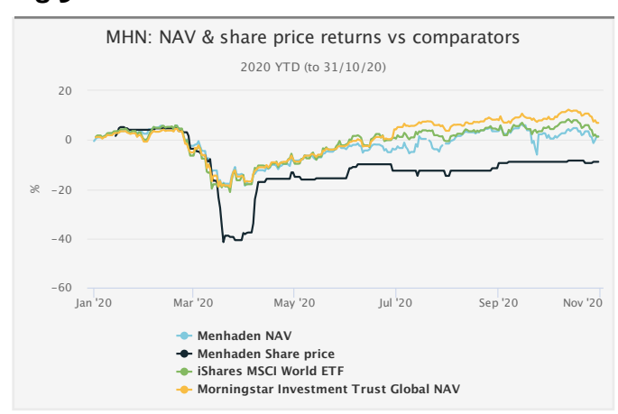
Fig.5: NAV Returns YTD

The graph below shows the experience of 2020 to date. As we note above, MHN announces NAVs only monthly, and the uncertainty caused by this factor may have contributed to the discount widening so dramatically during March and staying relatively wide since then. As the graph illustrates, the NAV recovered alongside equity markets and as at the end of October 2020, the NAV was just ahead of global equity markets.