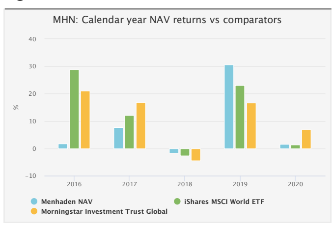
Fig.6: Calendar Year NAV Returns